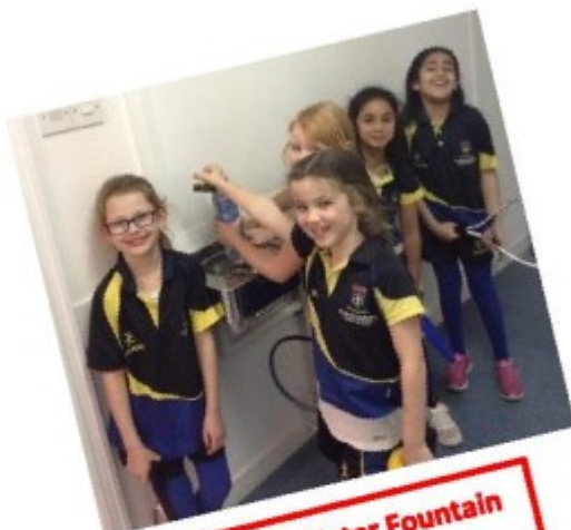
New Water Fountain in Gym