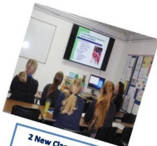
2 New Classroom Display Screens