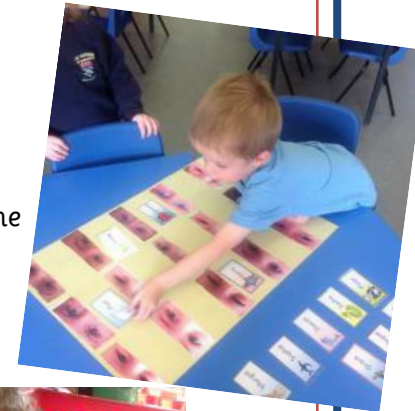
'Who can you see?' guess the person game