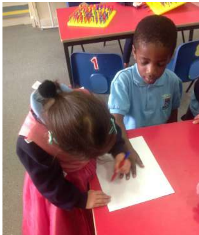
Drawing around our hands.