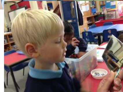
What colour are your eyes? We have been using mirrors to help us find out about our features.