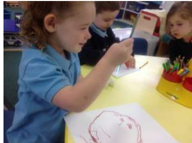
Drawing pictures of ourselves. Looking in the mirror to see what we look like.