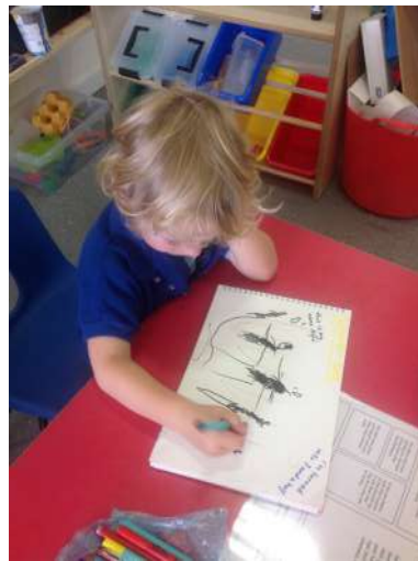
Drawing pictures of our families.