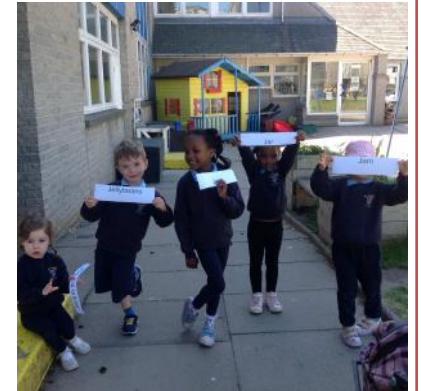
We went on a 'j' journey.