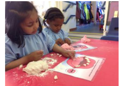
We made healthy teeth with playdough.