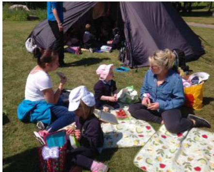
At Drum, we enjoyed our lunch in the tepee and had fun in the play park.