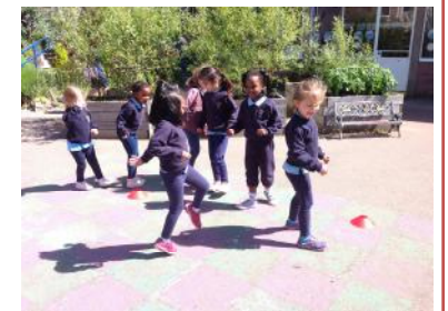
We played the 'Teeth Attack or Protect' game.

What will we be learning about next week? The letter 'x', number games and Grow Well Choices - Feeling Peckish.